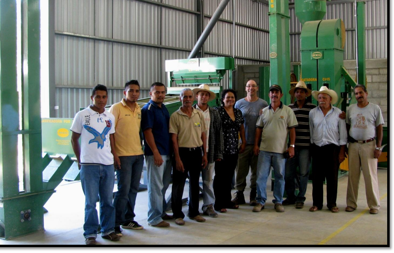
Fair Trade Cooperative, COMISUYL, in Subirana, Yoro, Honduras