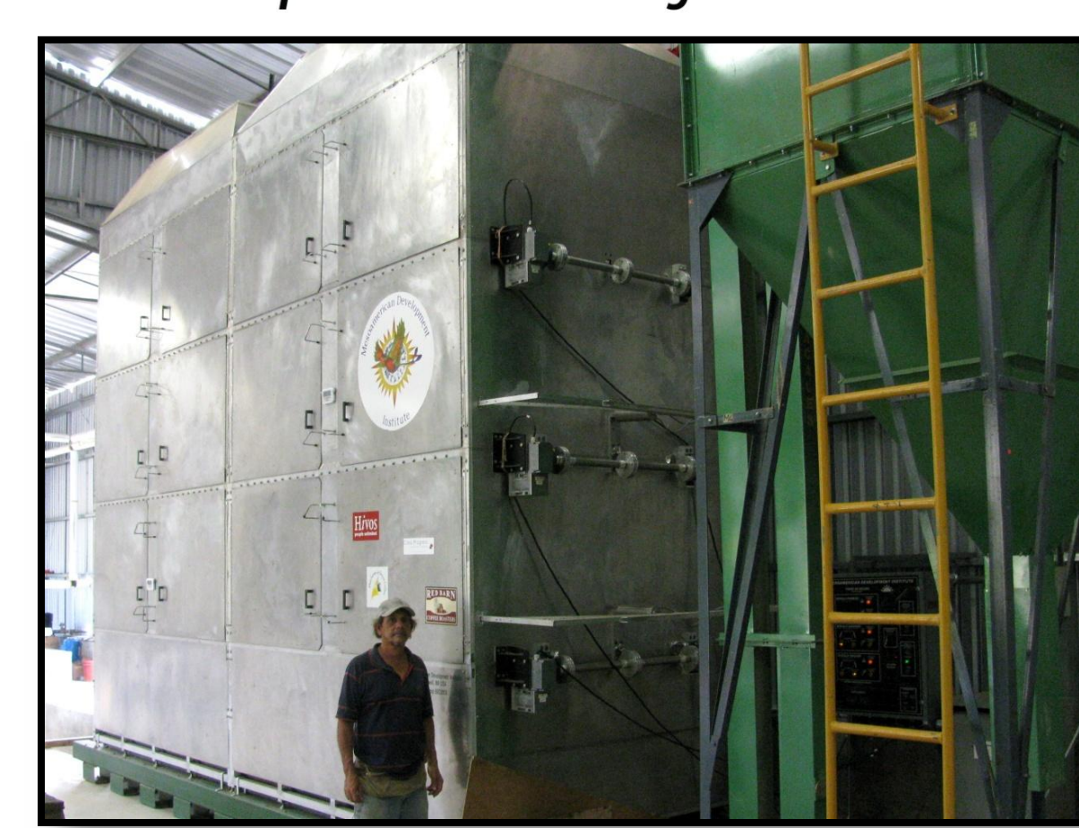
High-Efficiency Drying Chambers Manufactured in Massachusetts